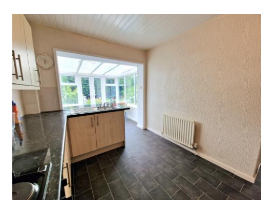
DINING ROOM / CONSERVATORY 10' 4" x 7' 10" (3.15m x 2.39m)